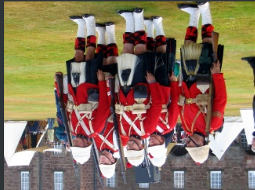
Horizontal and vertical flipped image