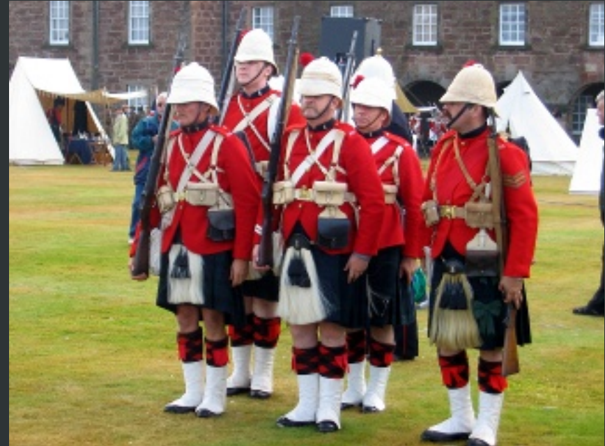
Horizontal flipped image