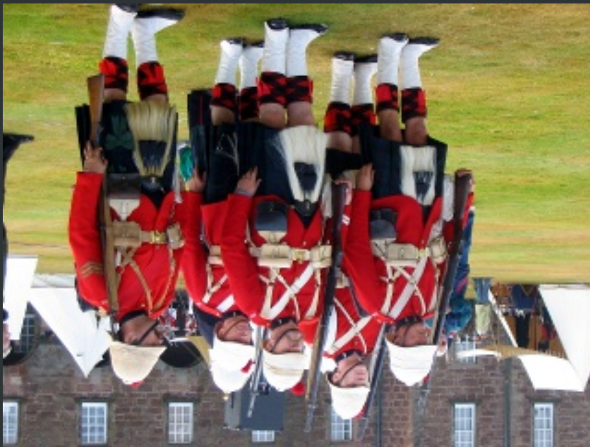
Vertical flipped image